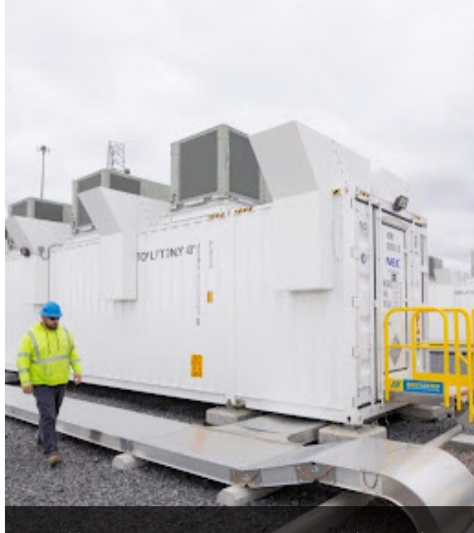
A 20 MW battery energy storage located in Franklin County, NY. Moratoriums have constrained the development of this critical infrastructure on Long Island